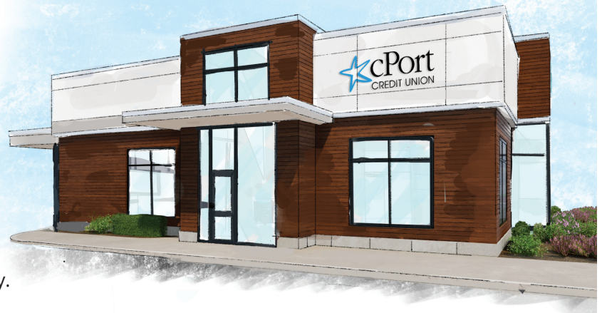
Artistic rendering of the entrance to the new cPort Credit Union branch that is coming soon to Main Street, Lewiston.

cPort is excited to join the Lewiston community and contribute to its growth and vibrancy. Our new branch will offer not just improved banking services, but also opportunities to engage with and give back to the local community. We look forward to fostering strong relationships and making a positive impact in Lewiston. We cannot wait to start serving members at our new branch location in 2025!