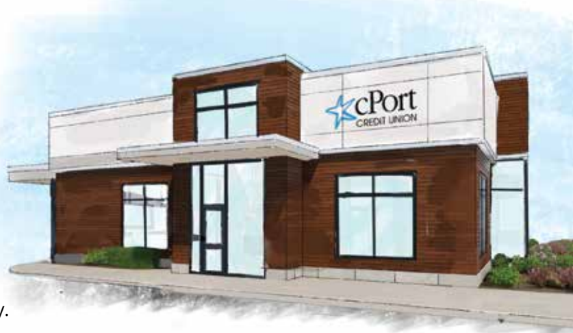
Artistic rendering of the entrance to the new cPort Credit Union branch that is coming soon to Main Street, Lewiston.

cPort is excited to join the Lewiston community and contribute to its growth and vibrancy. Our new branch will offer not just improved banking services, but also opportunities to engage with and give back to the local community. We look forward to fostering strong relationships and making a positive impact in Lewiston. We cannot wait to start serving members at our new branch location in 2025!