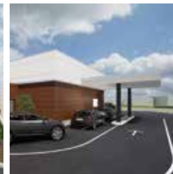
Drive-thru in back.

Visit cportcu.org/lewiston to see more views of the branch to be built in 2025.