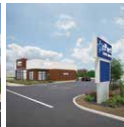
View from Main Street.